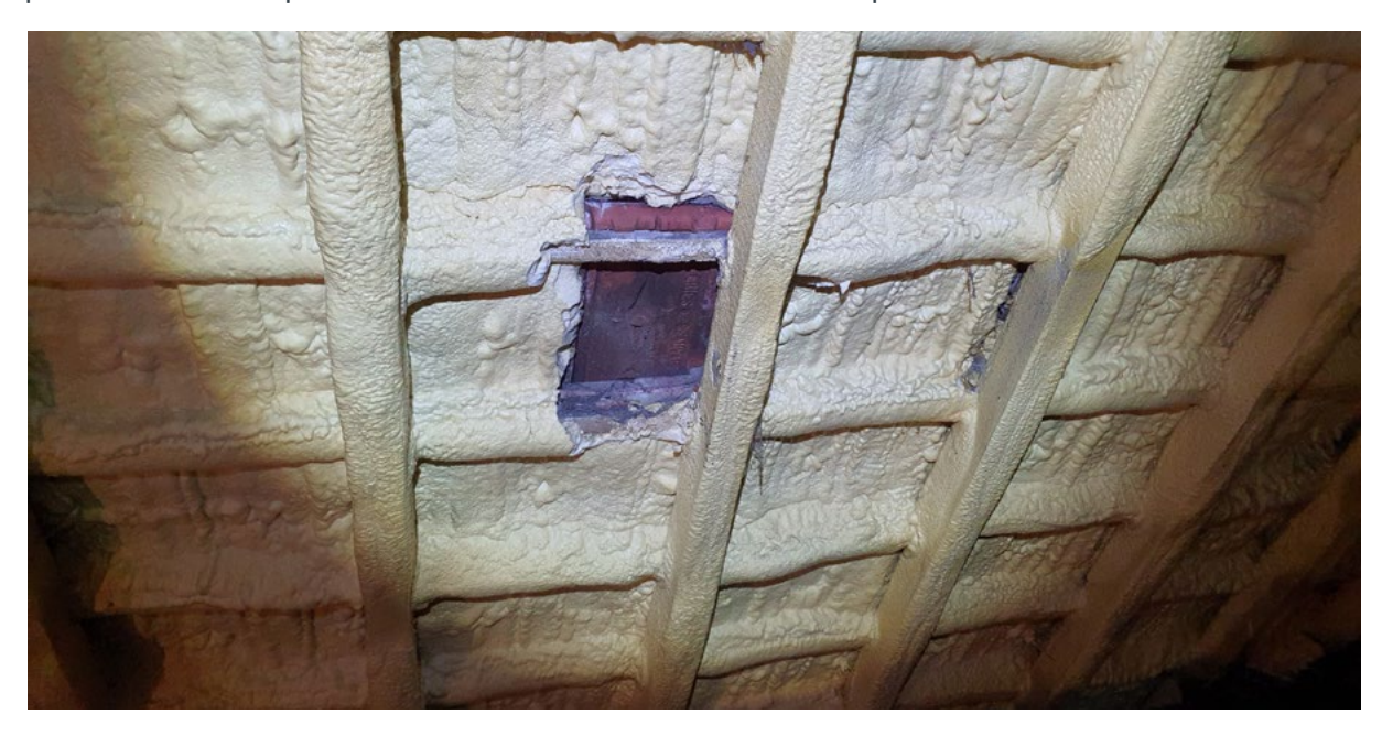
Figure 1: Spray foam used to stabilise a failing roof cover; a thin coating with limited heat retention but significant water problems

This guide also does not apply to roofs where a type of foam was applied to glue the roof tiles together. This is often done when an old roof is in need of replacement and the owner used spray foam as a less costly remedy to put off replacement and the primary reason was not to improve thermal performance. These roofs are often already past economic repair where the next action would be replacement.