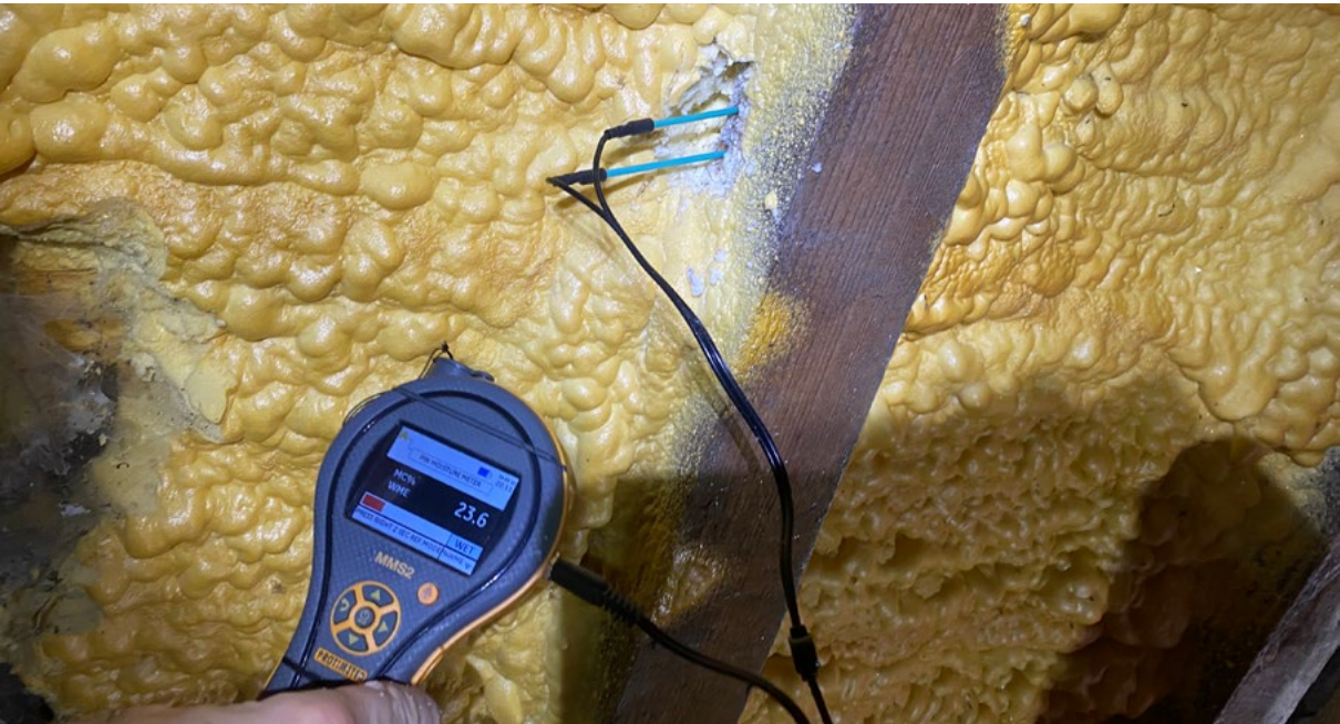
Figure 3: Spray foam insulation can make it difficult to identify problems to the roof because the timbers can be 'dry' on their exposed, visible surface but 'wet' behind the spray foam