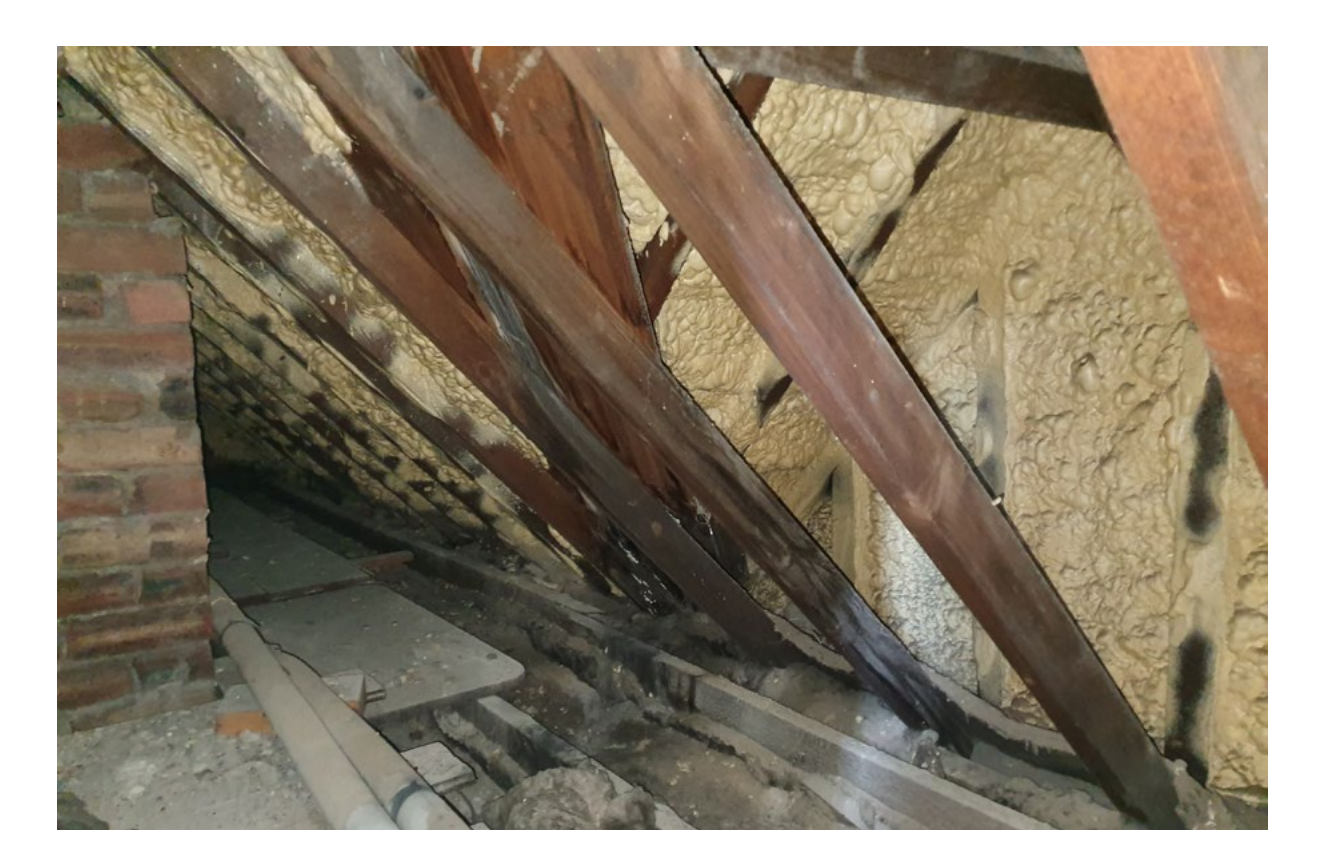
Figure 4: Example of spray foam incorrectly installed leading to condensation problems

RICS advises homeowners to seek independent expertise, commercially separated from the installer and manufacturer, to advise if spray foam is appropriate for their property. See the section Installing spray foam insulation in your home for more detail.