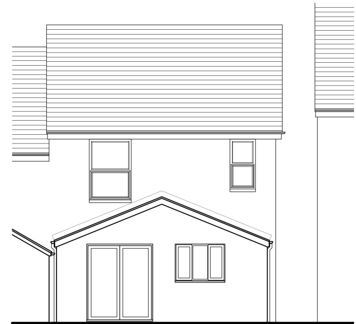
North Elevation 1:100